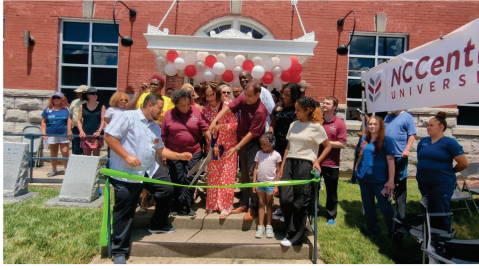
The grand opening of Henderson's Rural Community Resilience Center (RCRC) ribbon-cutting ceremony.

RCMI CENTER FOR HEALTH DISPARITIES RESEARCH