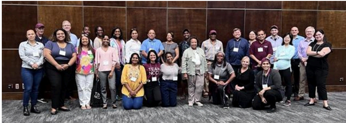
RCMI Retreat 2024

RCMI CENTER FOR HEALTH DISPARITIES RESEARCH