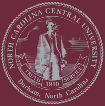
James E. Shepard, Founder