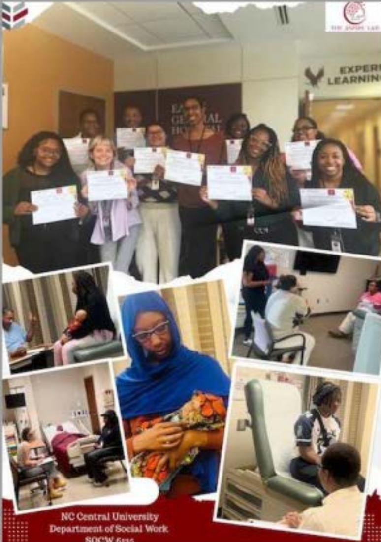
NC Central University Department of Social Work SOCW 6115